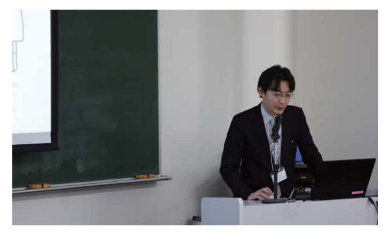
Session 4: "Historiography on Standards of Living and Family"