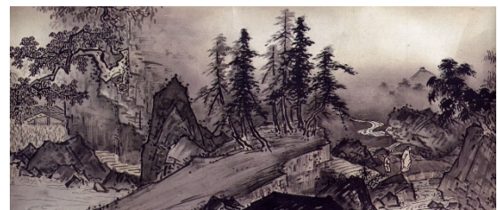
Sesshu Toyo, Sansui chokan , detail, 1496